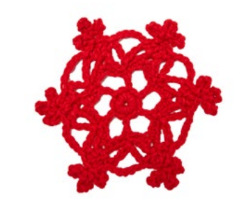
SNOWFLAKE 4 (make 2 for each repeat; 6 total for Runner) Round 1 (Right Side): Ch 4, join with slip st to form ring, ch 1, work 12 sc in